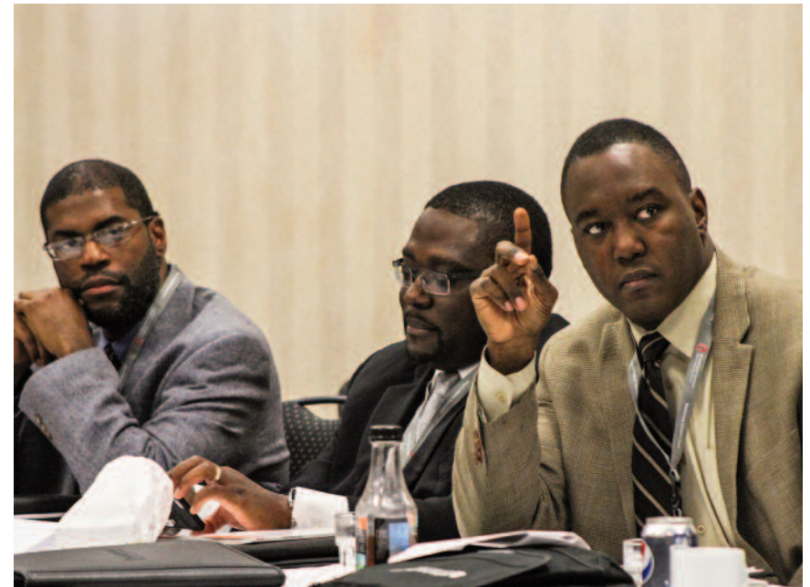
SBAS Leadership Institute attendees