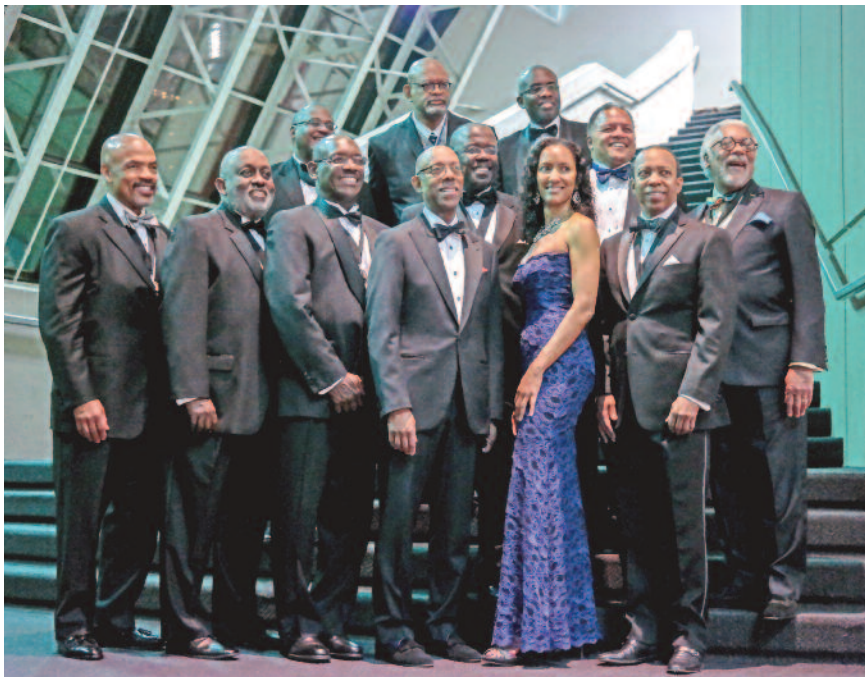
SBAS Presidents and Keynote Speaker Dr. Michael Drake.

Music Provided by: Blue Avenue II (reception); Ebb & Flow Jazz Group (dinner)