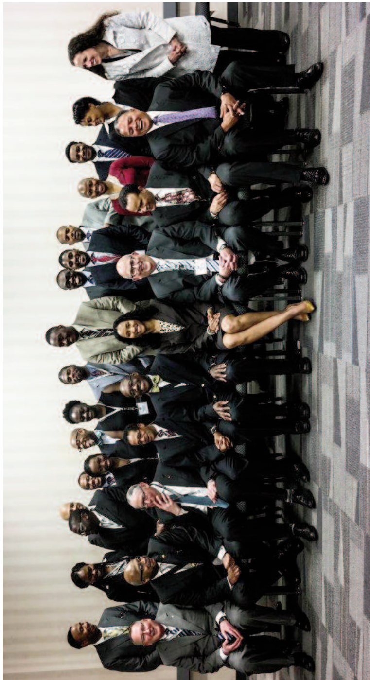
Group photo with SBAS Leadership Institute attendees and faculty