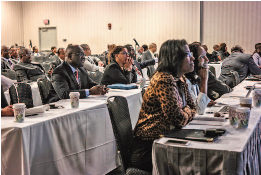
Attendees at SBAS main session