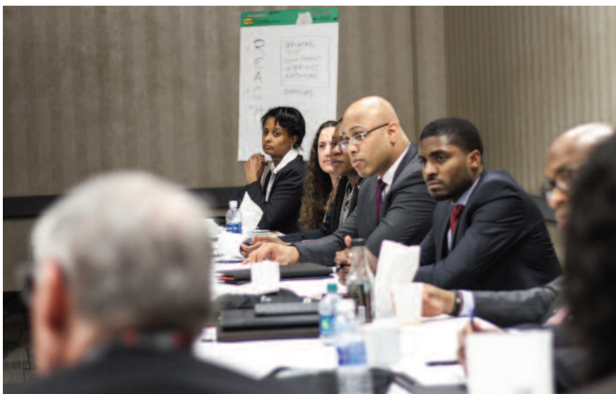
SBAS Leadership Institute participants