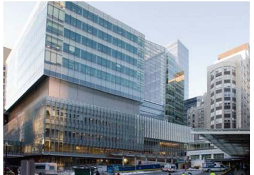
THE LUNDER BUILDING — MGH