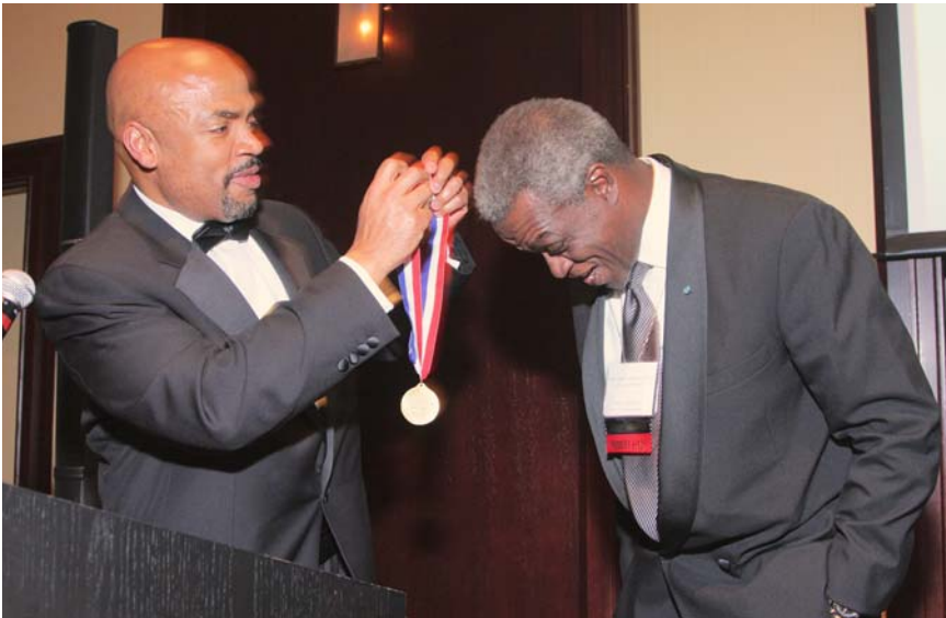
Passing the Baton