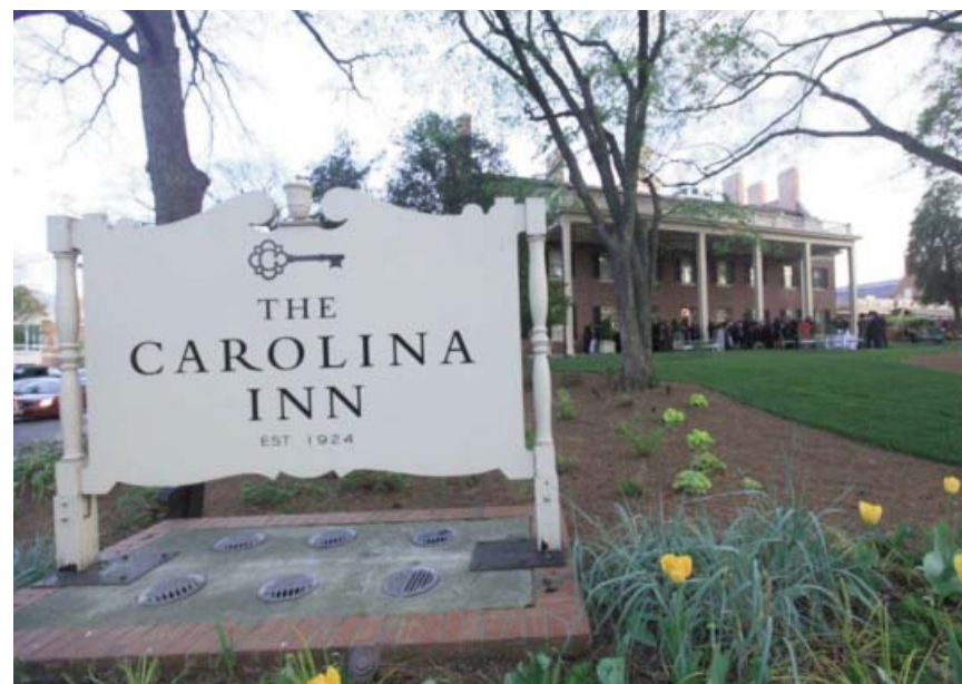
The historic Carolina Inn was the host hotel and meeting site for the SBAS Twenty-Fifth annual meeting held April 9-12, 2015.